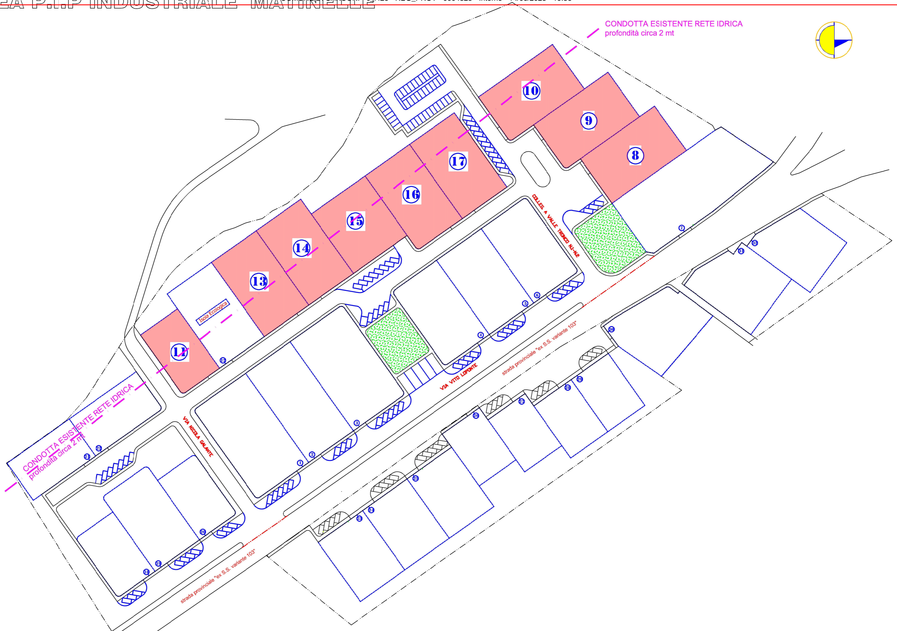
PLANIMETRIA * scala 1 : 1000